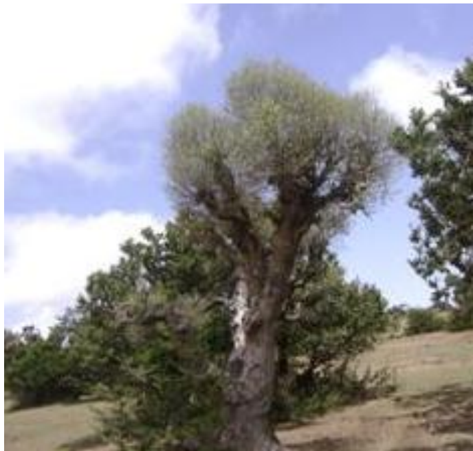
Figure 3. Regenerating native Olive tree after severe P. australis infestation at Eso, Atsebi-Wemberat District (Picture taken on 6 th of April 2013).